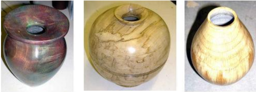
The Winning Entries