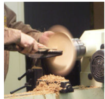
Support from behind