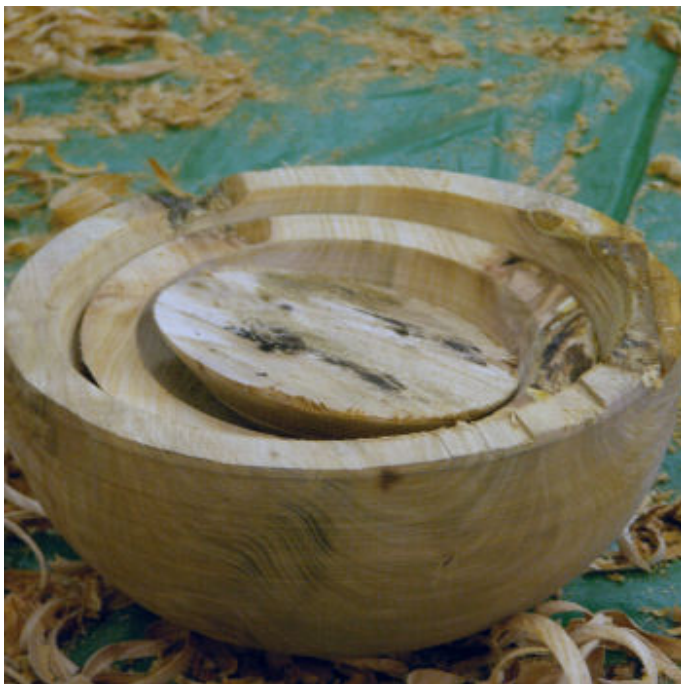
2 Three bowls from one blank

We saw three bowls turned out of one piece of cherry. This was green wood and shavings flew bountifully. It was then going to be processed by boiling in water for two hours then leaving to cool on the floor. The process removes the sap, leaving only the free water. The result is that there will be little distortion, splitting and the timber will be dry in a few weeks. Members found this concept very interesting.