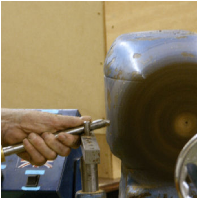
4 The peg in the tool rest

There was prolonged applause for a superb, yet very hot, evening.