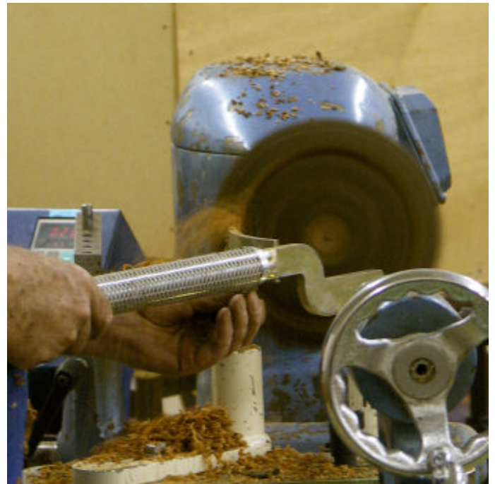
5 the OneWay system